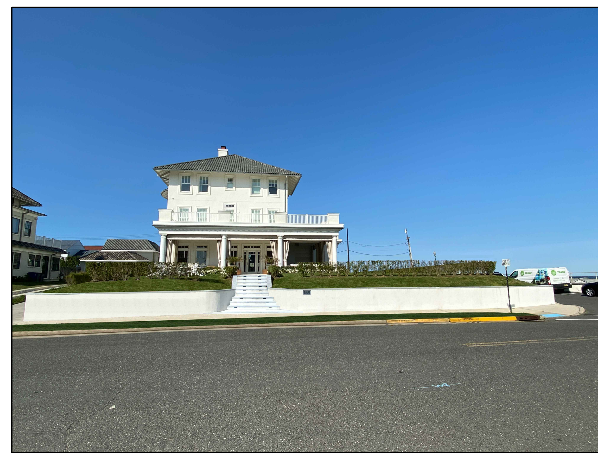
PROPOSED SPIER AVE. PHOTO RENDERING "A" NO SCALE