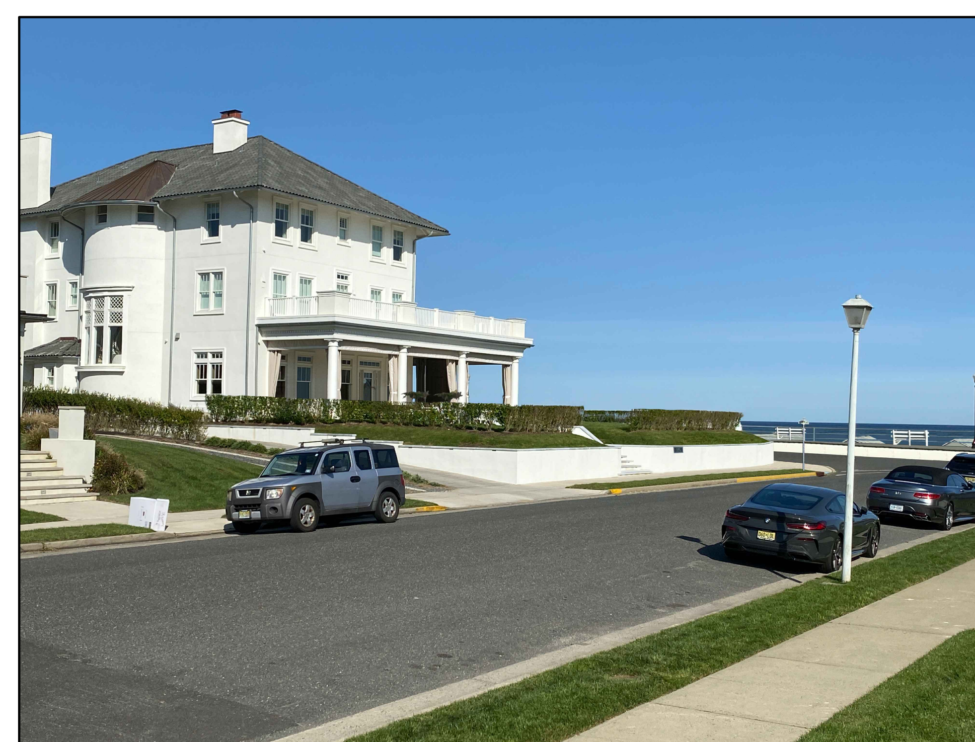
PROPOSED SPIER AVE. PHOTO RENDERING "B" NO SCALE

PROPOSED RENOVATION AND ADDITION FOR CHERA 1 SPIER AVENUE ALLENHURST, NJ