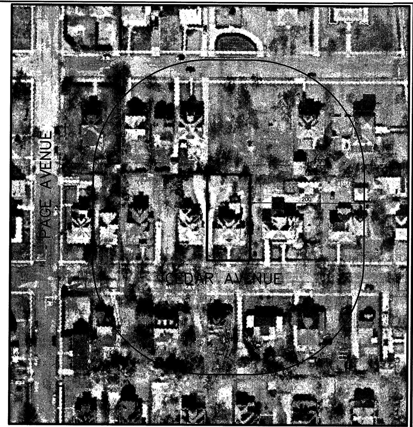
AREA MAP SCALE: 1"=200'